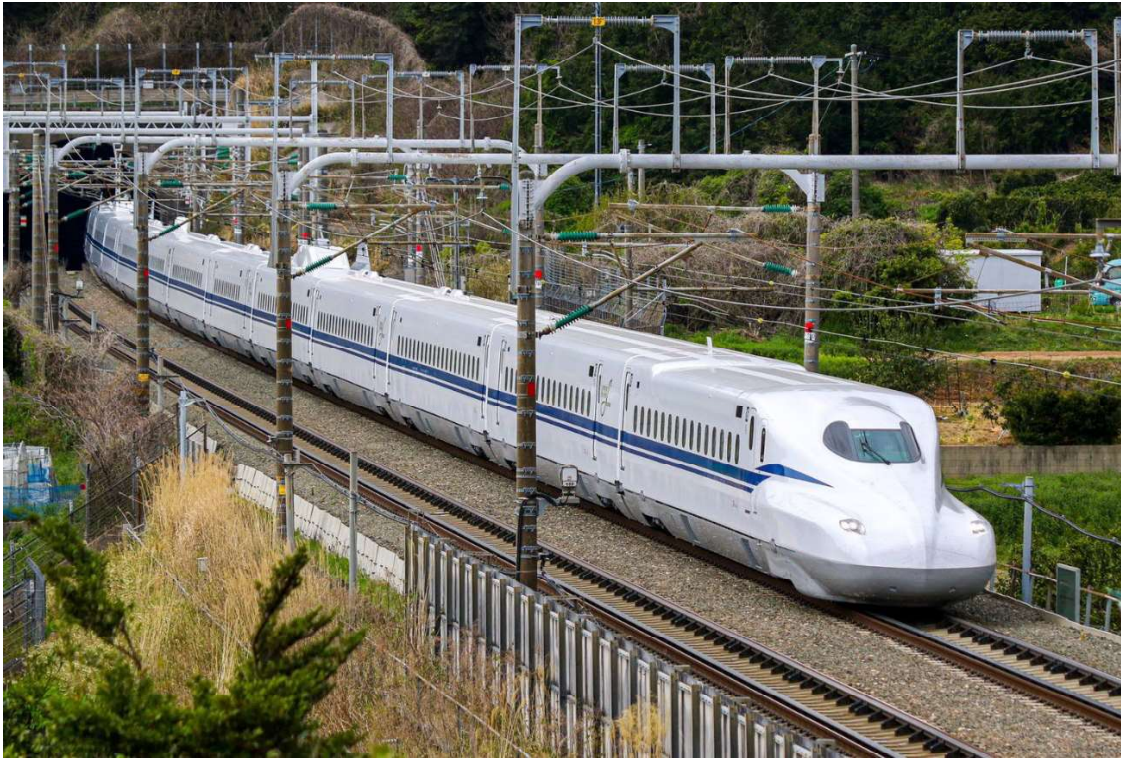
Series N700S Shinkansen Super-Express EMU