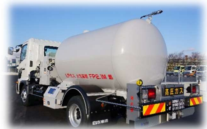
Bulk Tank Truck

In the steel structures business, sales were recorded for the works on Yumeshima North Bridge, Sugegaya Bridge Bearing Replacement, and Sakura-machi Pedestrian Bridge, and sales related to highway bridges to government and municipal offices increased year on year.