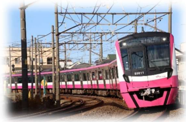
Model 80000 EMU

Keisei Electric Railway Co., Ltd., resulting in net sales of ¥4,801 million. As a result of these increases in rolling stock for JR Companies and others, the railway rolling stock business recorded net sales of ¥53,342 million, up 11.2% year on year.