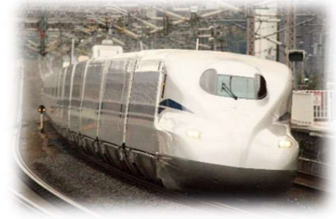
Series N700S Shinkansen Super-Express EMU

Our sales to the JR Companies, including Series N700S Shinkansen Super-Express EMU, Series HC85 "Hida/Nanki", and Series 315 Express EMU to Central Japan Railway Company resulted in net sales of ¥48,541 million. Sales to public and private railways included trains provided to Nagoya Railroad Co., Ltd., Nagoya City's Transportation Bureau, and Shin-