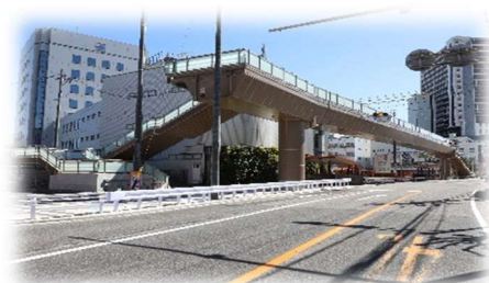
Sakura-machi Pedestrian Bridge

As a result of the above, net sales for the transportation equipment and steel structure business came to ¥15,529 million, up 12.1% year on year.