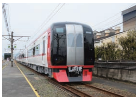
Series 2200 Trains for Nagoya Railroad Co., Ltd.

N1000 and N3000 trains for Nagoya City's Transportation Bureau; the Series 2200, 3150, and 3300 trains for Nagoya Railroad Co., Ltd.; the Model 12-600 trains for the Oedo Line of the Bureau of Transportation Tokyo Metropolitan Government; the Model 60000 trains for Odakyu Electric Railway Co., Ltd.; the Model 3000 trains for Keisei Electric Railway Co., Ltd; and the Model N800 trains for