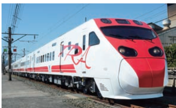
EMU with Tilting System for Taiwan

Shin-Keisei Electric Railway Co., Ltd. For railway cars for overseas, we had sales of ¥28,458 million, including bi-level EMU for the U.S.A.; diesel cars for Canada; trains for Venezuela, and EMU with a tilting system for Taiwan.