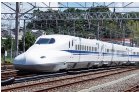
N700A Shinkansen trains for JR Central and JR West

In the railway rolling stock business, our sales to the JR Companies amounted to ¥25,910 million. It was achieved through the sales of the N700A Shinkansen trains to JR Central and JR West and the Model KiHa 25 diesel cars to JR Central. Our sales for the public and private railways reached ¥11,490 million, including the sales of the Series 1000 trains for the Tokyo Metro Ginza Line; the Models