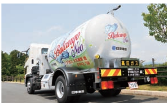
LPG Tank Lorry

In the transportation equipment business, we had sales of carriers, AGV, and other heavy-duty industrial vehicles, as well as LPG tank lorries. There were also demands for container flat cars and consumer-purpose LPG bulk tank lorries. As a result, sales reached ¥10,551 million, up 15.5% from the previous year.