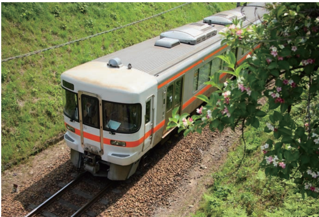
Model KiHa25 Diesel Cars